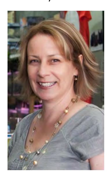
During 2011 Kerry conducted a series of workshops for community groups in the Buloke Shire. For those who were unable to attend Kerry has put together a series of information sheets.